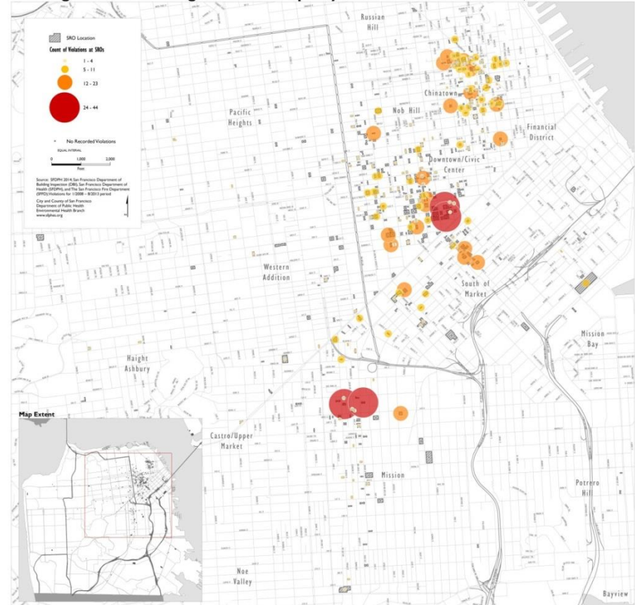
Housing Violations & Single Room Occupancy Locations - San Francisco, CA